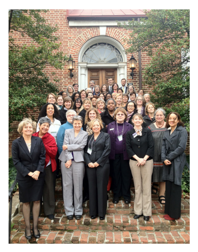
December 10 –11, 2012 Sewall-Belmont House and Museum Washington DC

Women and the Making of the United States